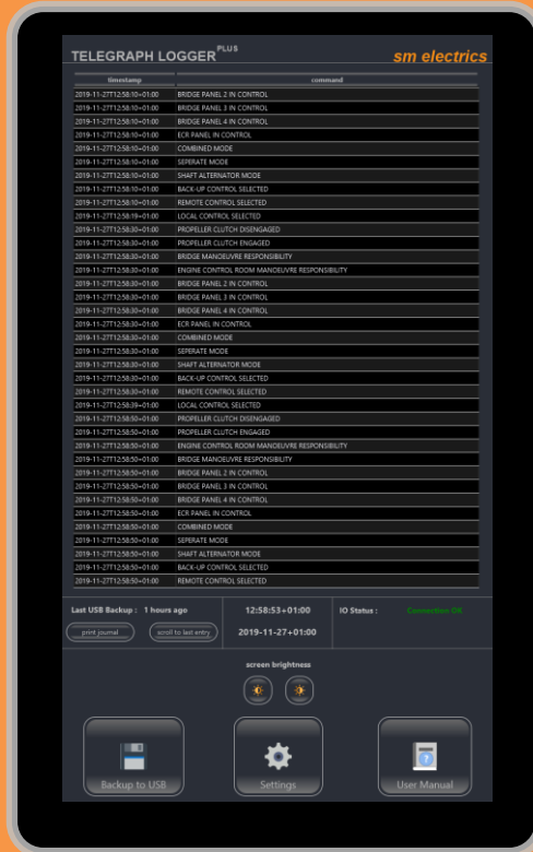
15,6" touch panel operation panel TLO 210.24.0.0